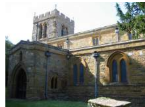
St. Mary's Church, Dallington

Once again our villages have been so generous over the Christmas season, donations of toys for children in refuges, baby essentials for mums who start out motherhood with nothing, Newnham School children donating from their Tuck Shop towards repairing the Church roof, money to the Children's society and the list could go on.